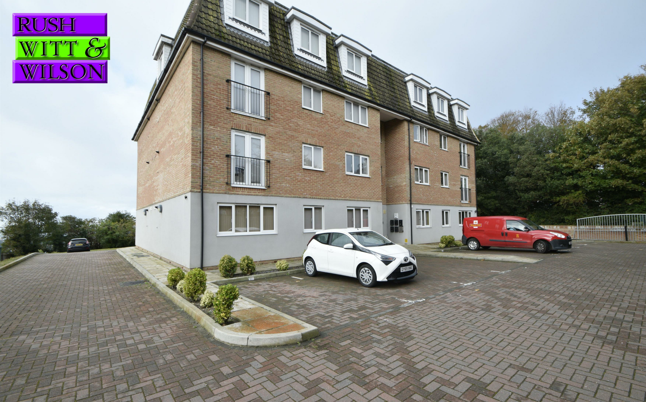
St Georges Lodge 195 The Ridge, Hastings, Sussex TN34 2AE £950 Per Month